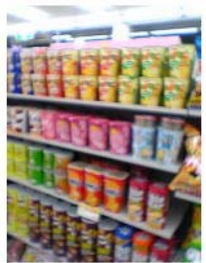
ゴールデンラインにじゃがりこ